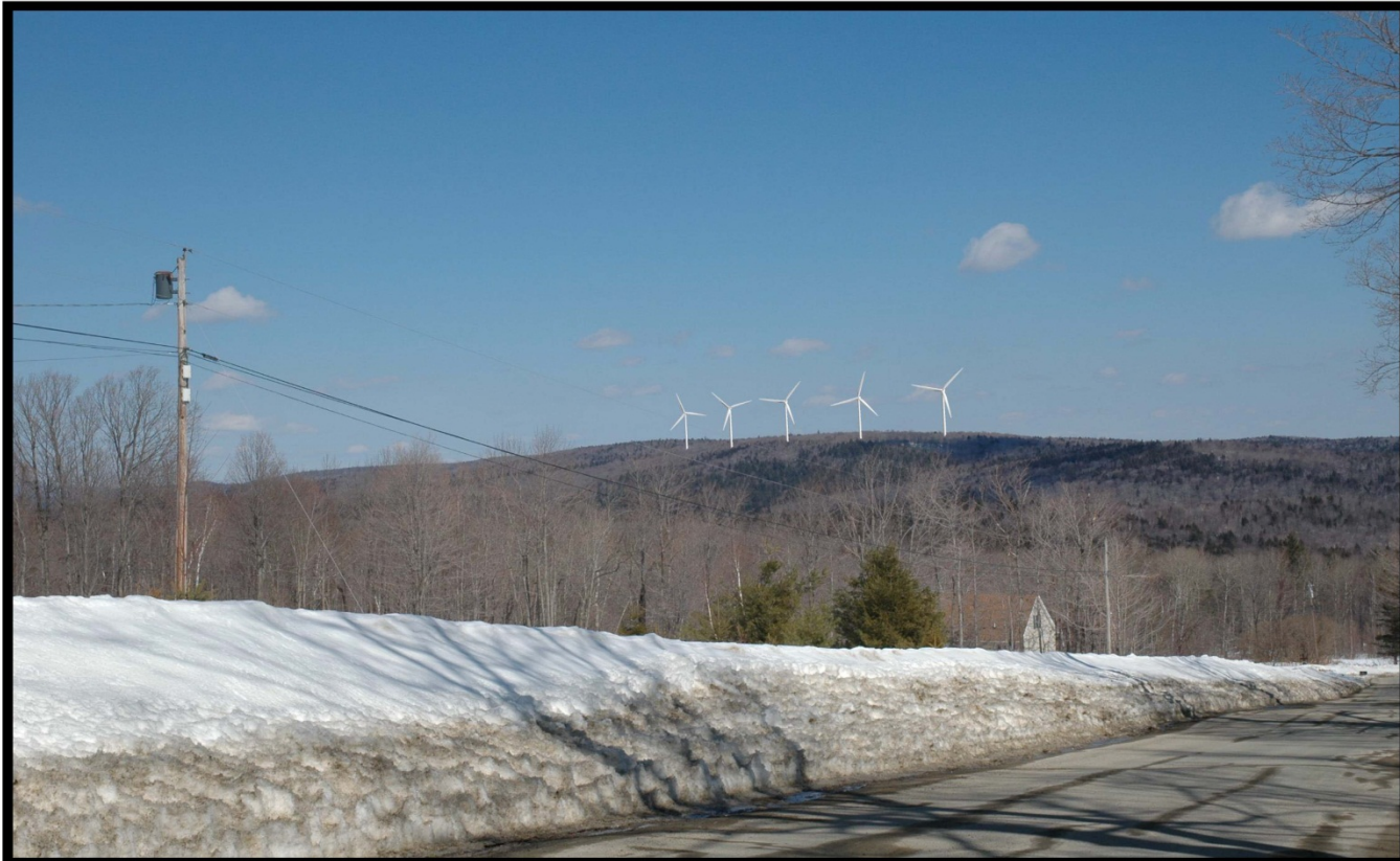
Photo Simulation of Savoy Wind Power Project