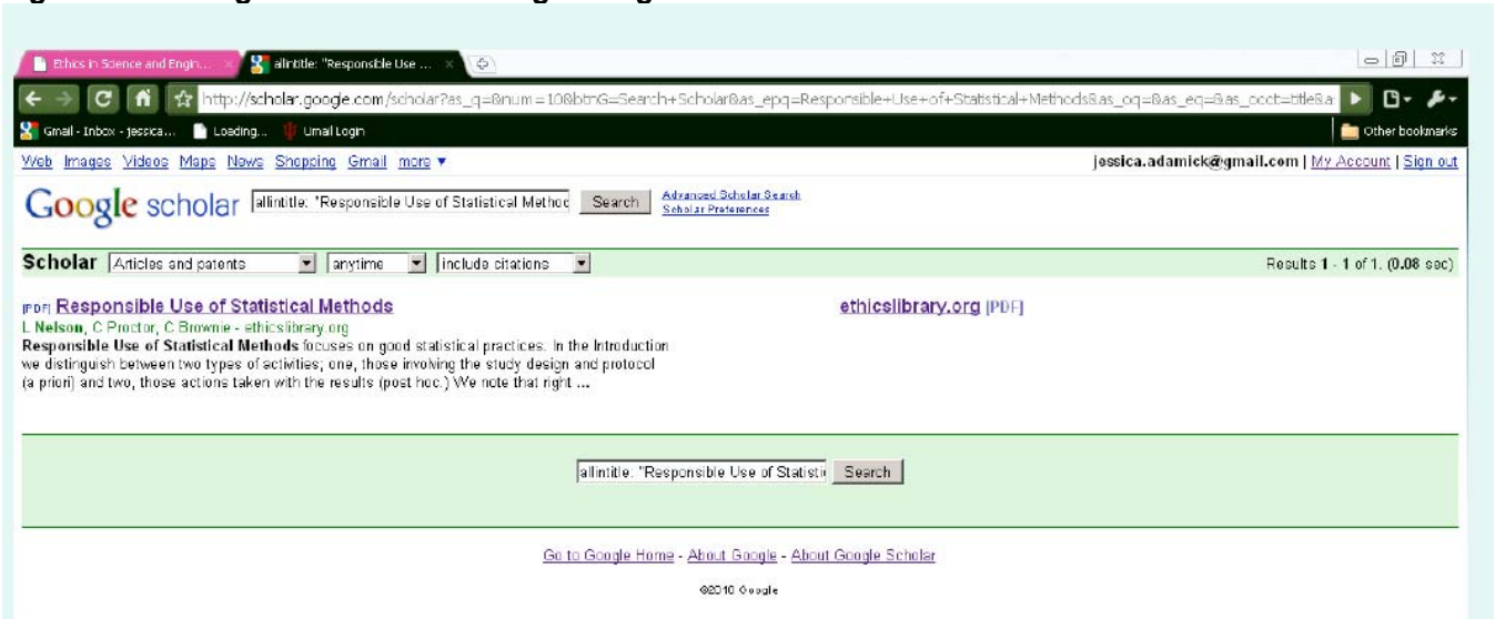
Figure 5: Pushing Out Materials through Google Scholar

Records within ESENCE are discoverable through popular search engines like Google Scholar and the Online Computer Library Center (OCLC) WorldCat, as well as through the ESENCE site itself.