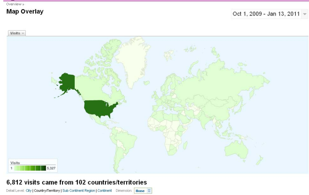
Figure 1. International Reach of ESENCE Materials

The map overlay above displays visually the reach of ESENCE materials. Visitors to the ESENCE website have come from 102 countries, with the majority of visitors coming from within the United States. (Figure from Google Analytics).