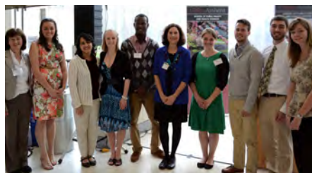
Department Awardees at the SPHHS Undergraduate Award Celebration

Many of our students were recognized for their outstanding achievements at the School of Public Health and Health Sciences Undergraduate Award Celebration .