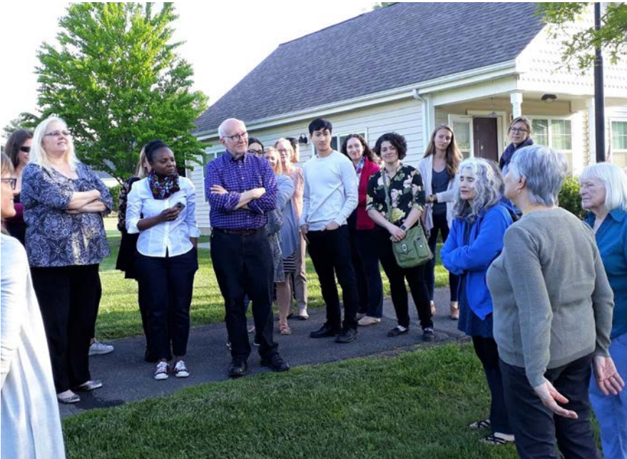
Participants in the 2017 Summer Adoption Research Institute visited the Treehouse Community in Easthampton to learn about its innovative intergenerational model.