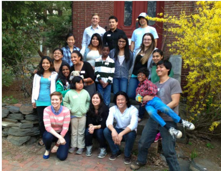
AMP mentors, mentees, and staff gather for the end-of-year celebration.

This university-community partnership, the first of its kind in the U.S., provides adopted youth with a mentor who understands the lived experience of adoption. Concurrently, AMP supports adopted young adult mentors in their own personal development through connections with adopted peers and psychoeducation on adoption and mentoring. Through the supported mentor-mentee relationship, positive psychosocial outcomes are promoted for both parties. To date, AMP has supported 46 mentor-mentee relationships (92 individuals), with three to six new matches formed each academic year. A sign of program success is that matches overwhelmingly continue into their second year, with many continuing into their third year and beyond.