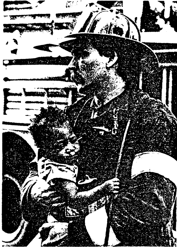
N.Y.C. Firefighter with homeless child at site of Hotel Bryant fire.

Project of the Hartford Action Plan on Infant Health, and has served as chairwoman of Connecticut Clergy and Laity Concerned. She recently received the YWCA's Women in Leadership Award for Humanitarian and Community Service.