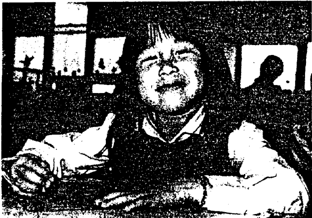
Student at P.S. 119 in South Bronx, N.Y.

Enough fleas, biting strategically, can make even the biggest dogs — the biggest institutions or governments — mighty uncomfortable. They may flick some of us off, but others of us, with innovative and principled ideas, will keep coming back. That's how we can all begin to live the ideals of America and make a profound difference in the lives of our children. ●