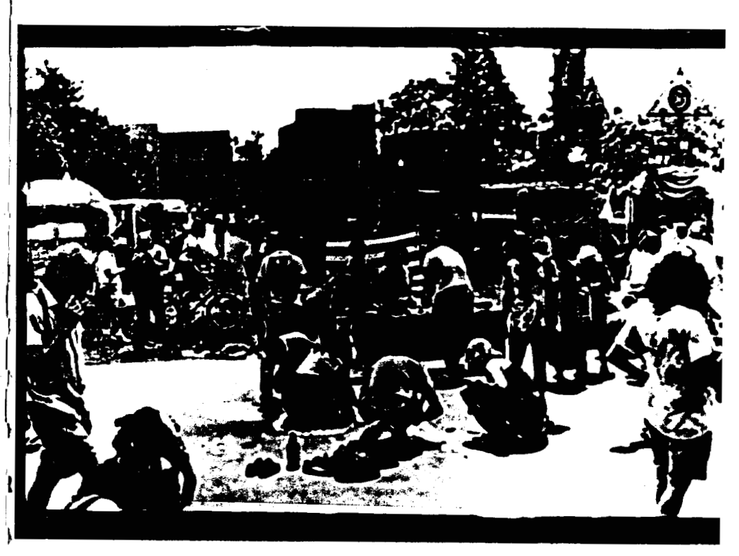
The end of the semester rally