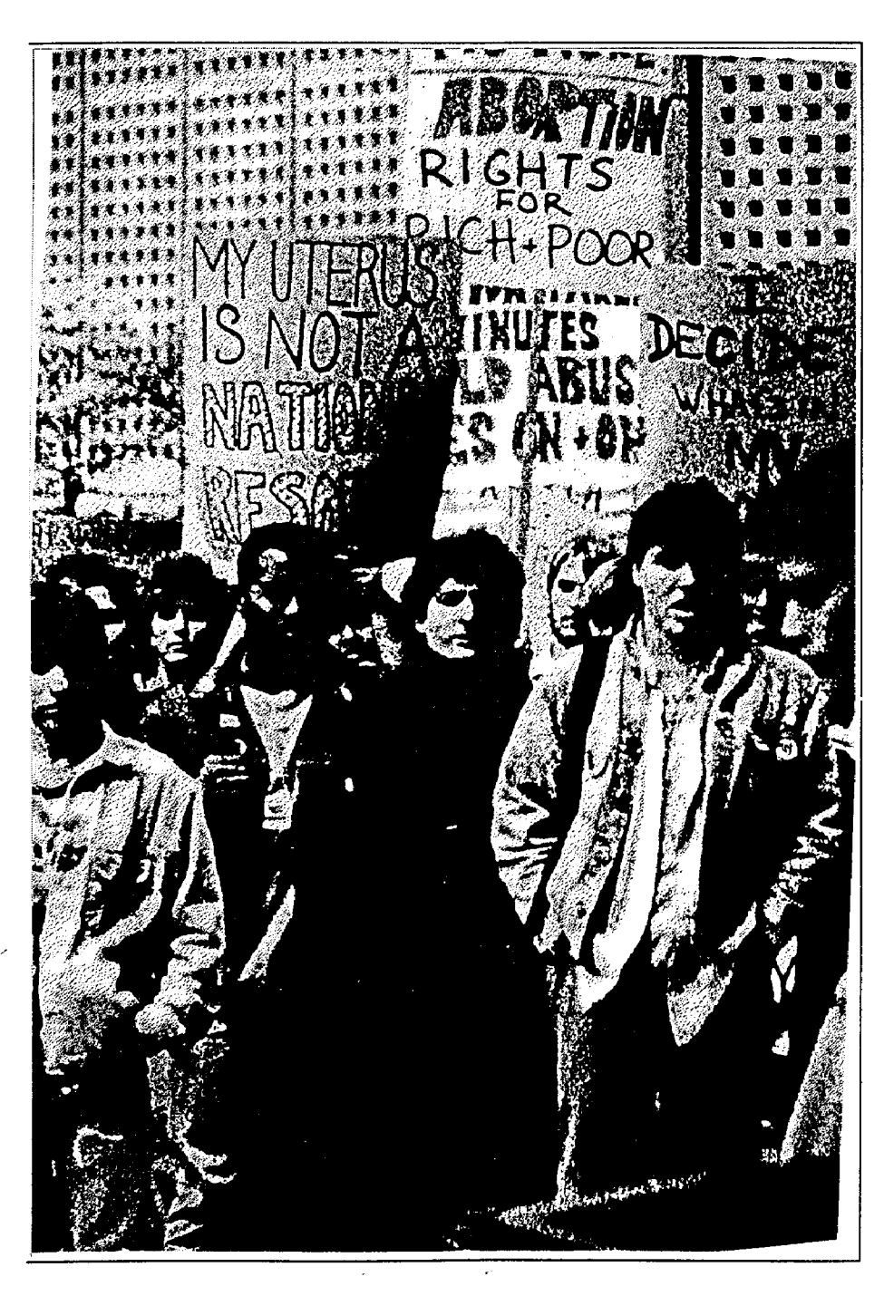
A pro-choice demonstration at the students union, UMASS