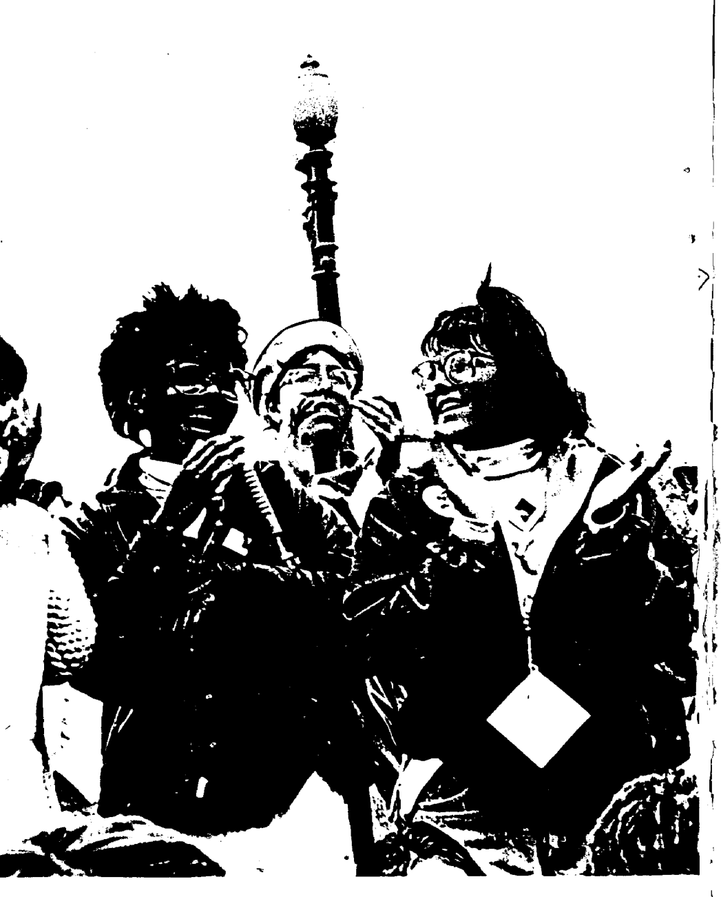
Pro-Choice March on Washington