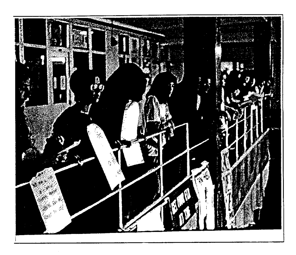
Women who died from illegal, unsafe abortions are commemorated