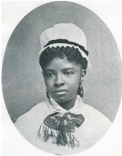
Mary Eliza Mahoney 1845- 1926

Mary Mahoney was born in Boston, MA in 1845 to freed slaves who had moved to Massachusetts from North Carolina. She graduated from the New England Hospital for Women and Children's professional graduate school for nursing in 1879 and is recognized as the first African American in the United States to earn a professional nursing license.