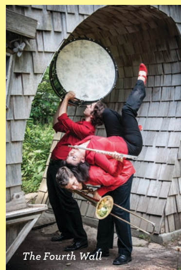
The Fourth Wall