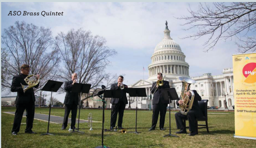
ASO Brass Quintet