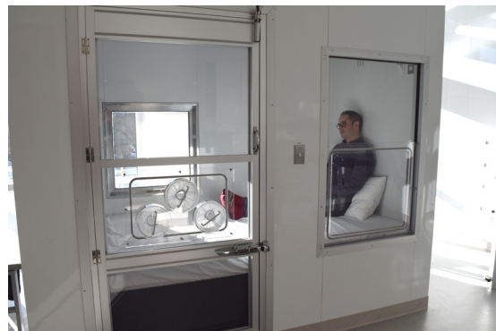
Small room calorimeter

One of only 26 such facilities worldwide, the UMass Room Calorimeter houses two whole room metabolic chambers