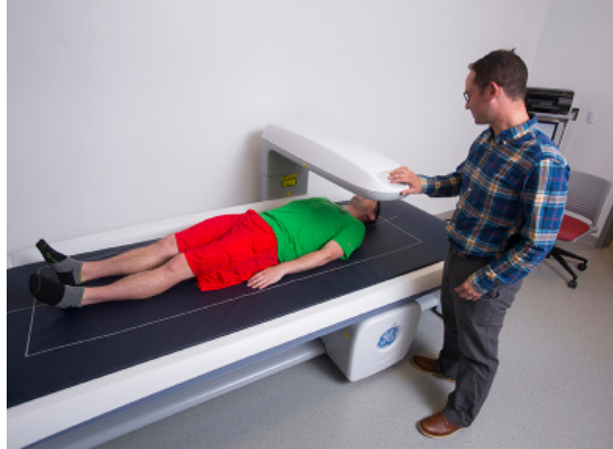
Bone density scanner.

Perform clinical participant intake and evaluation, bone densitometry & body composition, exercise testing, and exercise training