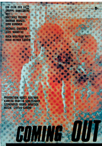
Original 1989 poster. Designer unknown.

During the first screening of the double premiere in East Berlin's Kino International, the Bornholmer Strasse checkpoint—where passage through the Wall that separated East and West Berlin was strictly controlled—unexpectedly opened. As word spread, people flooded through the checkpoint and out of East Germany, many for the first time ever. November 9, 1989 marked the fall of the Berlin Wall, which was a central symbol of Germany's post-World War II division and the GDR's dictatorial regime. The DEFA Studio for Feature Films, which had produced Coming Out , had expected the landmark premiere to get a lot of attention, but the opening of East Germany's borders and the fall of the Berlin Wall overshadowed the event in the short term.