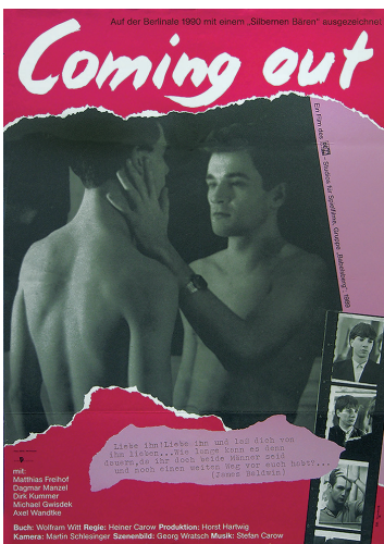
Original 1989 poster, by Gabriele König.

Beyond such experiences, the characters in Coming Out are shown in the context of East German society. What one sees in the film is a society with distinct troubles. One social problem is a proliferation of violence. At one point, neo-Nazis assault a Black German man, an attack that Philipp tries to stop. Later in the film, we see a few men verbally and then physically assault a gay man in a subway station; unlike in the earlier incident, Philipp flees and avoids intervening, as it is too personal for him. Another social problem, subtly presented in the film, is the pervasive surveillance and social control that is a product of a repressive society. Philipp is judged by the official structure of his school administration and his colleagues; and his mother’s inability to accept his sexuality leaves him lacking both social and familial support.