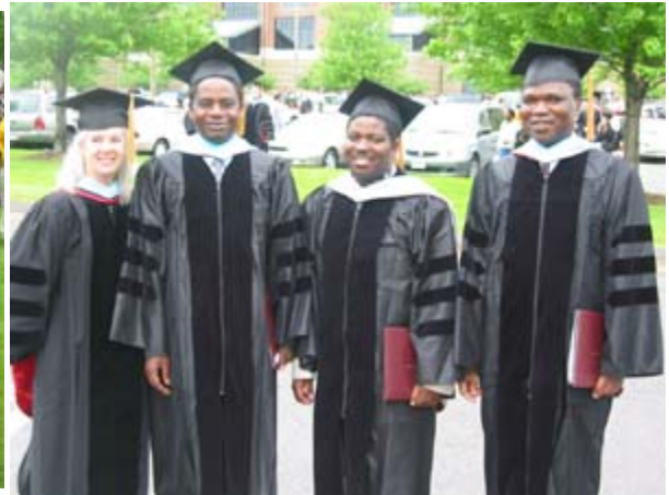
Three new Malawian doctors!