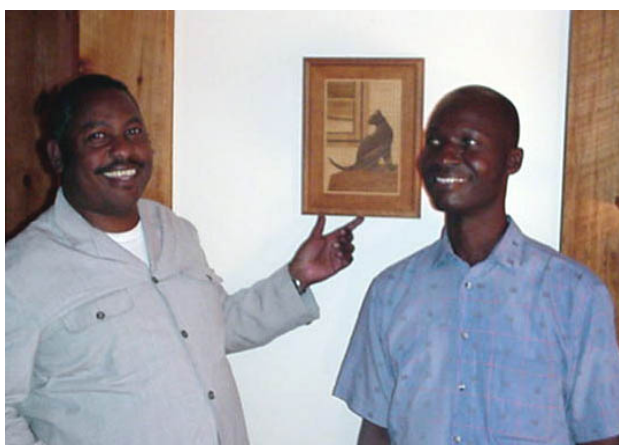
Anglophone Africa Shares a Moment