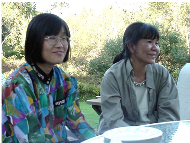
Fan & Pan