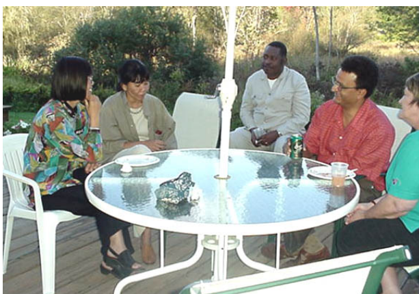
Roundtable at CIE Fall Reception