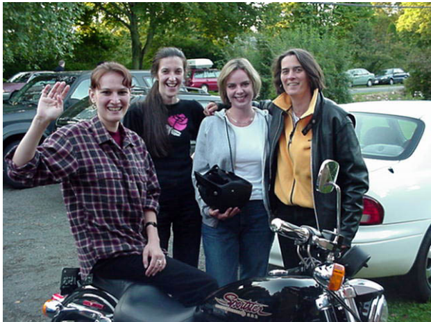
Muskies & the Motorcycle!