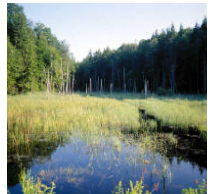
Powerline Wetland in Ashfield: Changes in water levels have occurred at this site because of beaver activity.