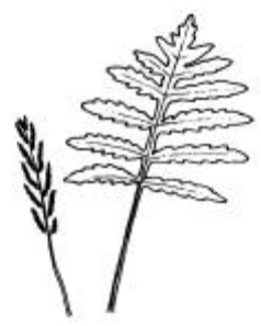
Sensitive Fern (Fertile Leaf on Left)

hands-on exploration. First, a short course on fern anatomy. The green, leafy part of the fern is referred to as the blade , which is comprised of leaflets or pinna . Within the blade, the stalk that bears the leaflets is technically defined as the rachis (ray-kiss), while below the blade it is called the stipe .