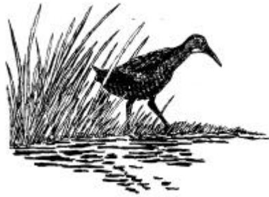
Virginia Rail Artist: Steven D'Amato

Both rails are about nine inches long and share a somewhat chicken-like profile. The Virginia rail bears a long, curved bill that is reddish in color, as are its eyes. Grey cheeks, black barring on the flanks, and an overall rusty coloration to the wings, breast and neck are typical of adults. Soras are distinguished from the Virginia rail by a black facial mask extending to the throat, brown barring on the flanks, stumpy tail, yellow legs, and a short yellow bill.