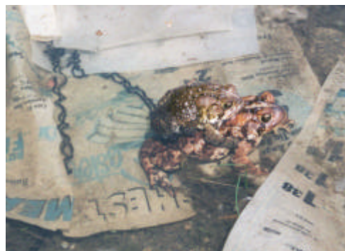
Mating American toads with double string of eggs. The larger female is on the bottom.

Advertisement calls comprise the bulk of an amphibian's repertoire. These calls function to attract females to breeding sites. The vocalizations are believed to convey information about the species, age, size, and vigor of breeding males. Typically, males congregate at a breeding site and begin calling. This, in turn, attracts other vocalizing males to the area. A cluster of several calling males of the same species is known as a chorus, such as that heard with spring peepers.