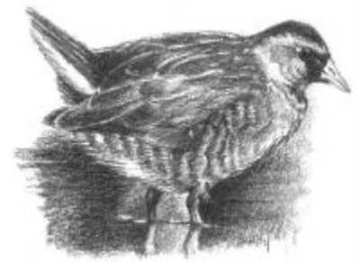
Sora Rail Artist: Daniel S. Kilby

Their voices, heard most frequently in the early morning hours and at night, are often the most reliable indication of activity. One call of the Virginia rail has been likened to the clicking of a telegraph wire. Another vocalization is a strange-sounding series of buzzy grunts. Soras give voice to an upslurred, questioning, “Per-weet?” often followed by a loud, descending whinny. Other behaviors are indicative of their preference for concealment. Both the Virginia rail and sora prefer to