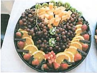
Our catering committee's Love Boat platter, featuring fresh fruit and fair-trade, organic chocolate

"It's a discouraging transformation that girls go through when the opportunity to come into ourselves as women is taken away by the stigma that has been created around the topic of what goes on down there between our legs."