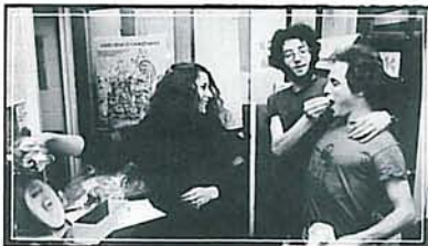
Here are a few co-managers in 1978, our fifth year of operation

society, perceptions of women's menstrual cycles took a turn for the worse. The concept of moon lodges was twisted in many cases, turning the release from domestic responsibility into an act of shunning women from society for their inexcusable (but really, just unavoidable) bleeding. One especially oppressive practice that occurs today takes place among the Kolosh Indians of Alaska, who confine girls in tiny huts with only one hole through which to obtain air or light when their period first arrives. The girls are forced to stay in this hut for an entire year during which they aren't allowed any fire, exercise, or company. You don't have to have a vagina to see that there is something wrong with this picture.