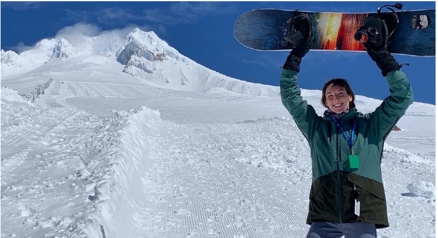
Snowboarding on Mount Hood, Oregon, me before going to the top!