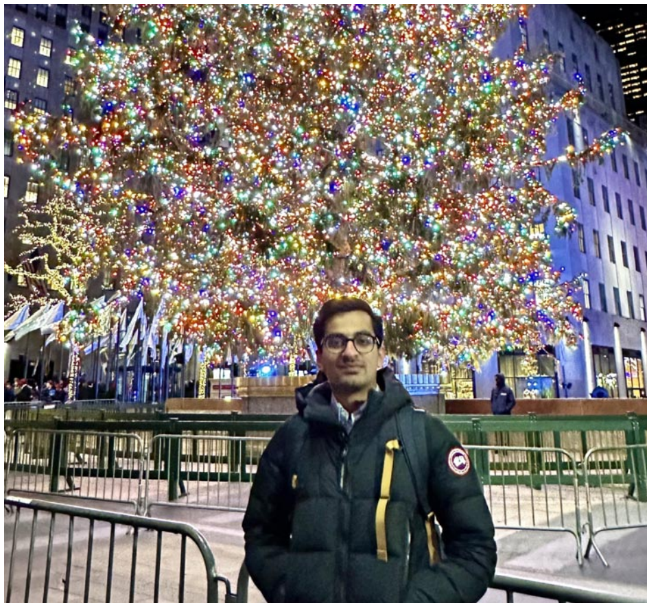
Outside my office in New York City