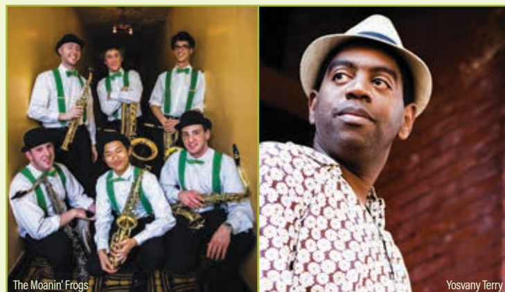
The Moanin' Frogs