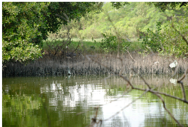
Students observed Mangroves inside the Theosophical Society.

This is the second year OMHS is participating in Tamil Nadu Science Forum and this year, we have taken the competition to another level. With ten projects going on, students are learning about a range of subjects from termites to energy conservation. This year's Forum is entitled 'Save our Earth' and has inspired students to