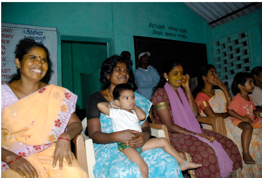
Mothers of Urur Olcott Kuppam's primary school children.

The community dinners are a way to build relationships with the parents. The idea is to go to the community without any specific school agenda and simply get to know them. Thus far, community dinners have been held in Chemincherri and Urur Olcott Kuppam.