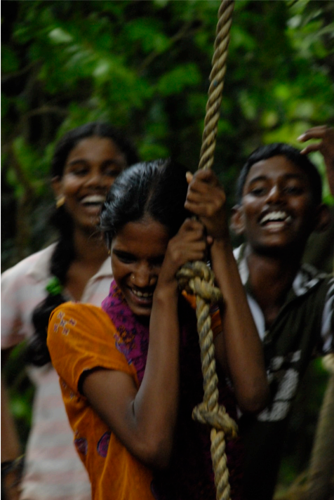
Students playing at Johnny's Place in Auroville.

“I’m excited when I come to school everyday because I get to be a part of the TNSF science project.” – 6 th Std student