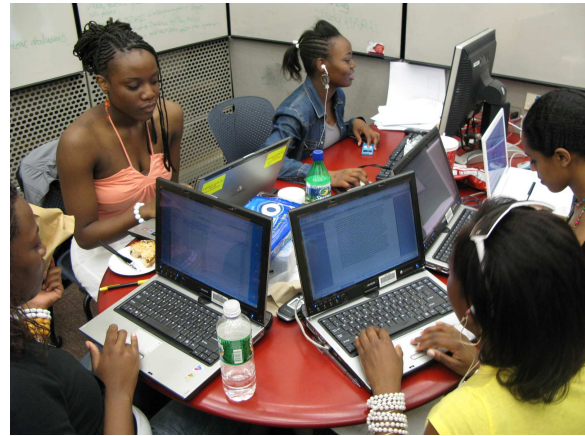
Laptops being put to good use in a group study room