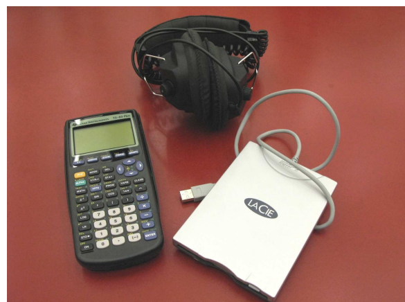
Now available for loan from the LC Desk