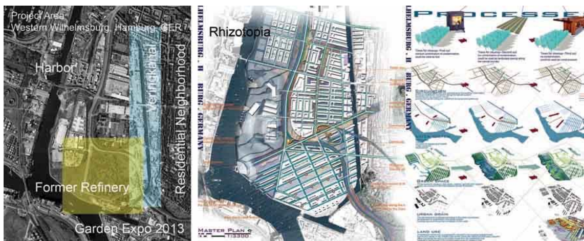
Fig. 1: Project Areas - The remediation network provides the framework for a multi layered green infrastructure as design system. (Samimi, Wang, 2007)

The proposal for a “Remediation infrastructure as a green infrastructure framework” transforms the contaminated waste landscape into a healthy urban landscape that is well integrated with the city. The reed and grass planted remediation ditches and multi-lane alleys of fast-growing, deep rooting hybrid poplars and willows become part of the street and pedestrian circulation network that structures the urban form for the future and connects to the existing neighborhood [Fig. 1]. After the area is cleaned up, the water remediation network can be transformed into a surface stormwater treatment system and the multi-lane alleys can become street boulevards.