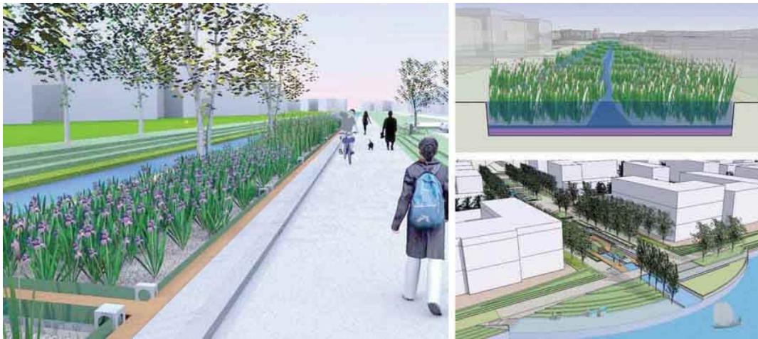
Fig. 3: Plants for remediation and waste treatment are green infrastructure as a changing landscape for sensual experience . (Lynch, Maynes, Metz, Samimi, 2008)