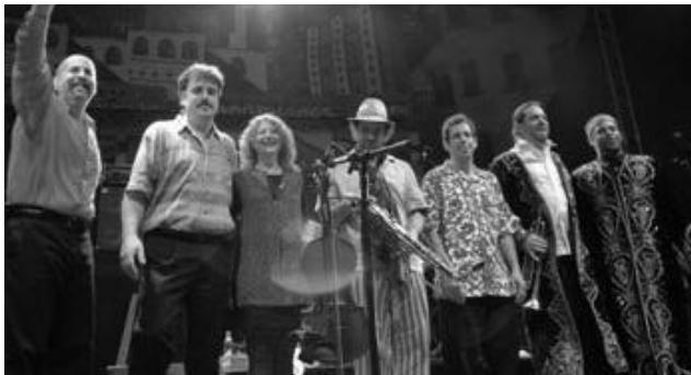
The Klezematics and Joshua Nelson

Tickets: General Admission $12; children $8; Five College students free (with ticket and ID). Tickets available at the Fine Arts Center Box Office, 413.545.2511 or 800.999.UMASS or online at www.umass.edu/fac