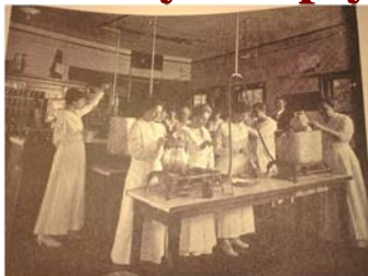
Massachusetts Agricultural College-canning class 1917