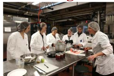
UMass Amherst food preservation class 2017

From its beginnings in canning classes to the industrialization of food manufacturing to developing foods for health and wellness, much has changed over a century of food science