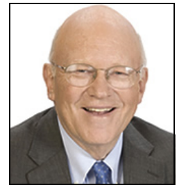
Ken Blanchard Author of "The One Minute Manager," the All-Time #1 Bestseller on Managing Your Work and Life, and co-founder of The Ken Blanchard Compa-